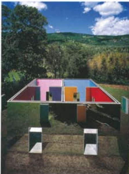
Above: Jean-Michel Folon, The Tree of Golden Fruit , 2002. Detail of aviary installation. Below and detail: Daniel Buren, La Cabane Éclatée aux 4 Salles , 2005. Mirrors, paint, and marble, 4 x 8.75 x 8.75 meters.

Indoor works have been commissioned recently as well. Anselm Kiefer's Cette obscure clarté qui tombe des étoiles (2009) is located in two adjoin-